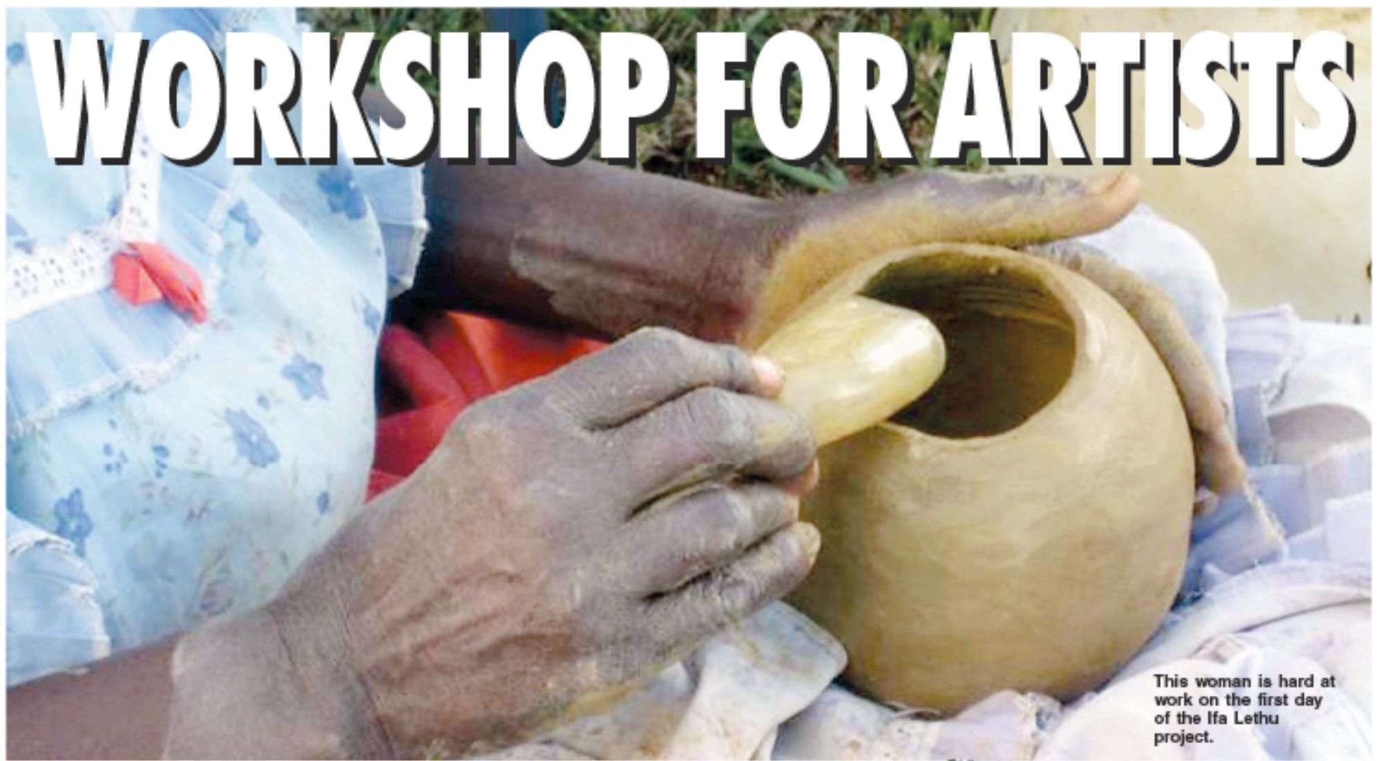
This woman is hard at work on the first day of the Ifa Lethu project.